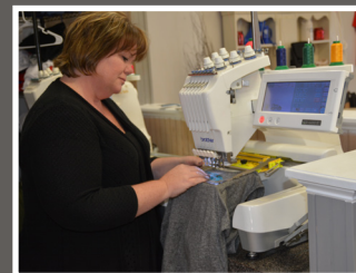
Wendy Blough Shirt Shop